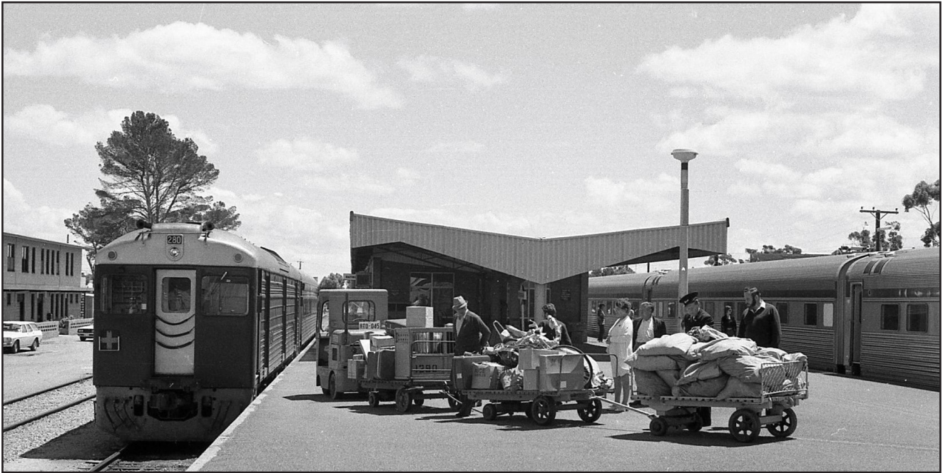
CHANGING TRAINS AT PETERBOROUGH. The train on the far track is the westbound Indian Pacific which has unloaded many mail bags that would have been from Broken Hill. On the near track is the Bluebird railcar, on the broad-gauge, that will travel to Adelaide via Terowie. When they constructed the Peterborough platform they gave themselves plenty of room. Quite different to the platform at Terowie.

In the next chapter we will examine the developments in South Australia under the leadership of 'Uncle Tom' Playford.