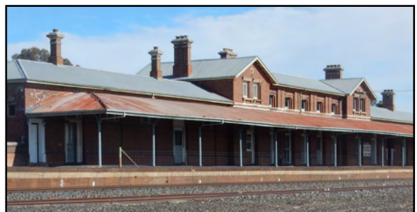
Serviceton railway station

But time brought many changes And within the halls of power, New faces surely did emerge; It all got rather sour. The day the new expresses ran, Each crossing midst the plains No champagne or brass band event M.P.'s snubbing these great trains.