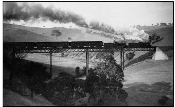
The Express at Callington. B 1256

In the decades since that followed Many names for her were coined “Footy Express”, “The Overdue” When the colonies were joined. The name that stirred the passions, And well suited her the best Was by engine crews at Ararat, “The Grand Old Lady of The West”.