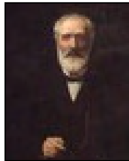
Sir James Service

James Service led that eastern town. John Downer was at the other; And Service, he held him in esteem And was treated like a brother. That lonely border station Would need a noble name; Serviceton! Did Downer cry Befits that man of fame.