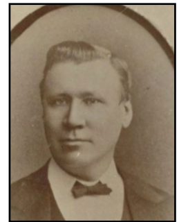
Sir John Downer

But time brought many changes And within the halls of power, New faces surely did emerge; It all got rather sour. The day the new expresses ran, Each crossing midst the plains No champagne or brass band event M.P.'s snubbing these great trains.