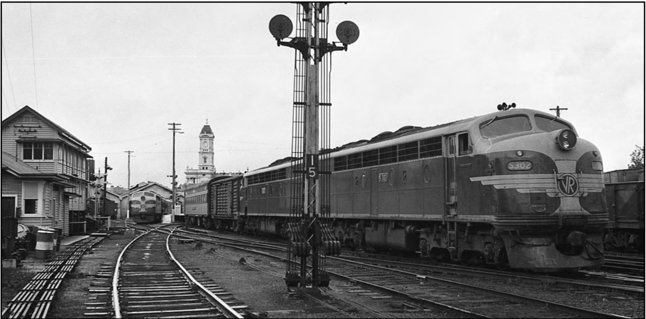
The Overland at Ballarat

( The Overland express between Melbourne and Adelaide, and “The Serviceton Summit” of 19 June 2020.