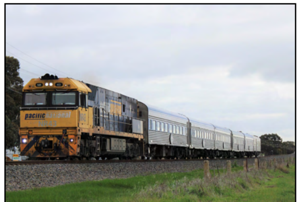
The Overland from Adelaide approaching Horsham.

That border station summit Didn't happen quite as planned, But an electronic gathering Rallied friends across the land. You may see her in your travels, Give a hearty toot or wave; But better still, buy tickets, For her future thus we'll save.