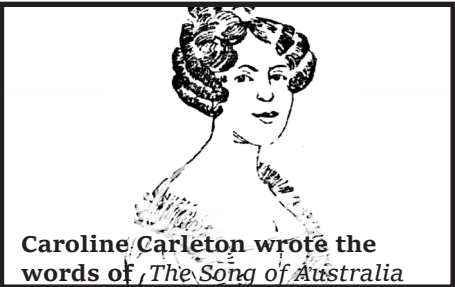
Caroline Carleton wrote the words of The Song of Australia